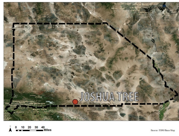
Figure 1: Joshua Tree Location