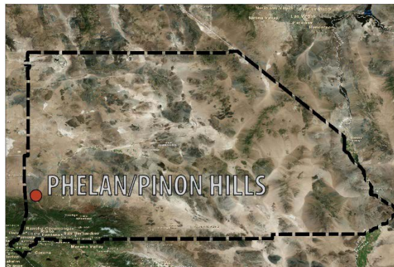
Figure 1: Area Map