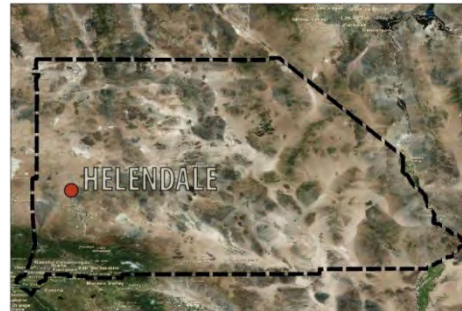
Figure 1: Helendale Area Map