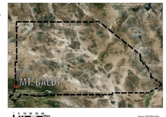
Figure 1: Mt Baldy

Mt Baldy, San Bernardino County Community Profile