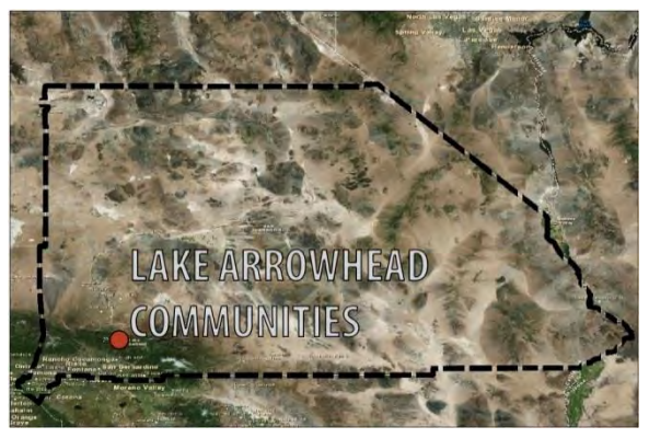
Figure 1: Area Map Source(s): ESRI, San Bernardino County LUS

The Lake Arrowhead Communities are located 23 miles north of the City of San Bernardino in the mountain area of the San Bernardino National Forest, with Crestline to the west and Bear Valley to the east. Source(s): ESRI, San Bernardino County LUS