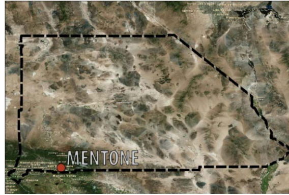
Figure 2: Community Map