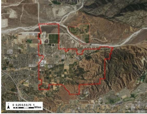
Figure 1: Area Map

The community is at the base of the foothills bordering the San Bernardino National Forest.