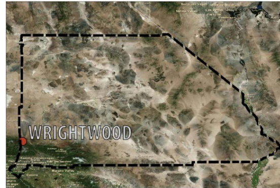
Figure 1: Wrightwood location.