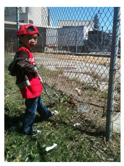
Community cleanup program in Oakland, CA.

Benchmark: A community cleanup program has been organized with adult and youth leadership and hosts at least four cleanup events per year. Champion: Volunteer group or person or can be identified by the community Estimated Cost: $2,000 per event