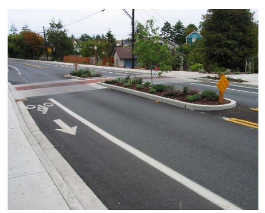
Pedestrian island and bicycle lane traffic calming measures.

Champion: Volunteer group or person or can be identified by the community Estimated Cost: $25,000–$5,000,000