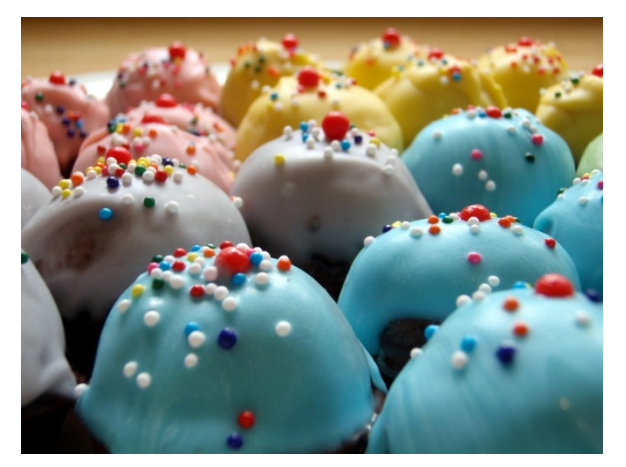
California law now provides for a regulated environment for food-based home businesses.

Benchmark: Developed a small-business specific committee or organization that serves as a point of contact for issues impacting food-based businesses. Champion: Volunteer group or person or can be identified by the community Estimated Cost: variable depending upon the program established