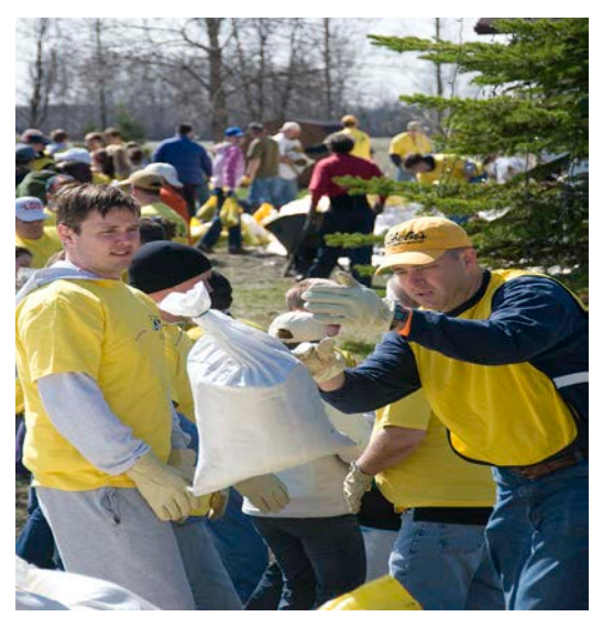
Volunteers from a church group help clear sand bags in Minneapolis MN.

Benchmark: Formation of a leadership committee with representatives from each church or institution. Hold one large community-wide event on an annual basis, with smaller monthly/biweekly events held for specific groups of Muscoy residents. Champion: Volunteer group or person or can be identified by the community Estimated Cost: variable dependent upon the program established.