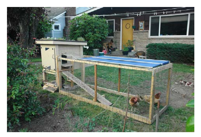
Backyard chicken coop with a green roof.

Champion: Volunteer group or person or can be identified by the community Estimated Cost: variable dependent upon the program proposed.