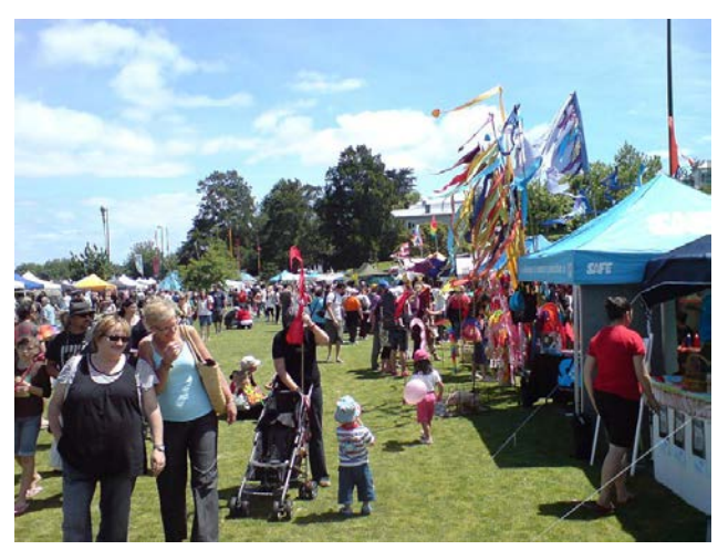
Community festival.

Benchmark: One large annual community event and several smaller events/activities are held every year, with diverse attendance from Muscoy. Champion: Volunteer group or person or can be identified by the community Estimated Cost: variable depending on events