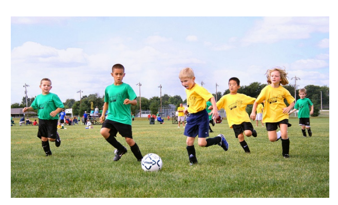
Youth soccer program utilizing joint development.

Benchmark: Muscoy residents have access to green spaces throughout the community. Champion: Volunteer group or person or can be identified by the community Estimated Cost: variable depending on the proposed project