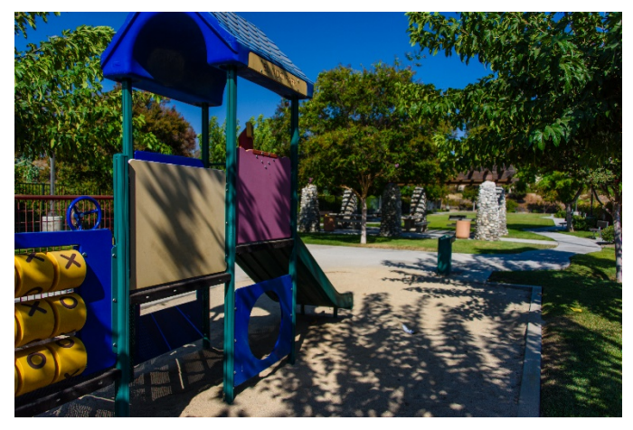
Pocket park in a residential neighborhood in Irwindale, CA.

Benchmark: Established a Pavement to Parks program or a similar Lost Lots program to turn vacant lots into community parks, developed guidelines and funding for the program to ensure the program continues to function for a period of at least three years. Champion: Volunteer group or person or can be identified by the community Estimated Cost: $20,000 – $100,000