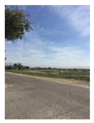
In some cases, adding sidewalks to common routes for students may be able to create a safer environment to travel in.

Benchmark : Implemented a successful, community-led SRTS program. Champion : Volunteer group or person or can be identified by the community Estimated Cost : variable depending on proposed improvements.