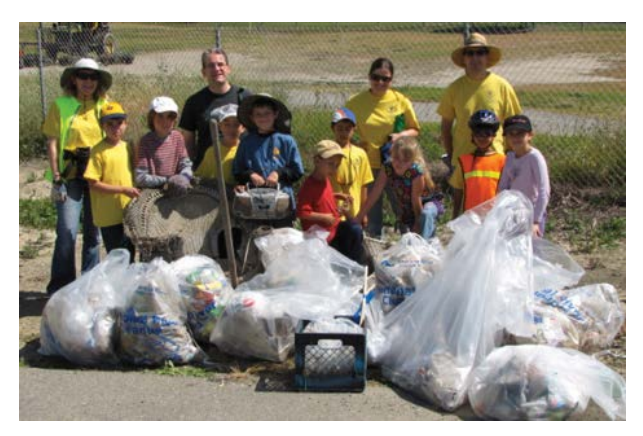
The City of Santa Clara has several events focused on cleanup and recycling. The city has an annual cleanup campaign to set out bulky items that are not collected by weekly garbage pickups, and holds a citywide garage sale twice a year to get rid of clutter and reuse items that would otherwise go to the landfill. For more information, visit http://santaclaraca.gov/residents/events/annual-clean-upcampaign

Champion : Volunteer group or person or can be identified by the community Estimated Cost : $750-$1,250