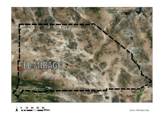
Figure 1: Area Map