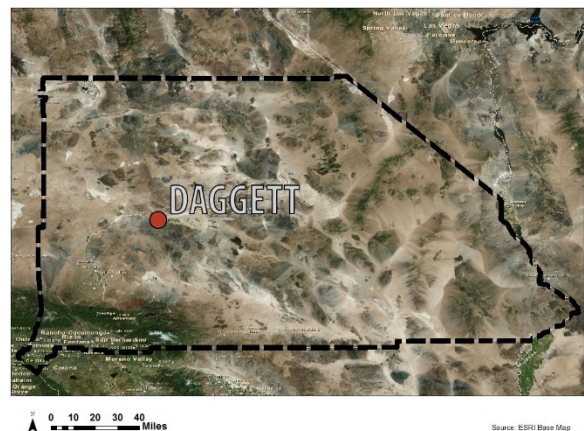
Figure 1: Daggett Area Map