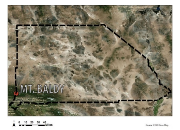
Figure 1: Mt Baldy Location.