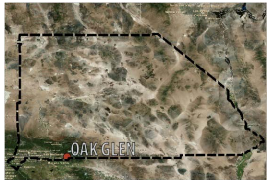
Figure 1: Area Map