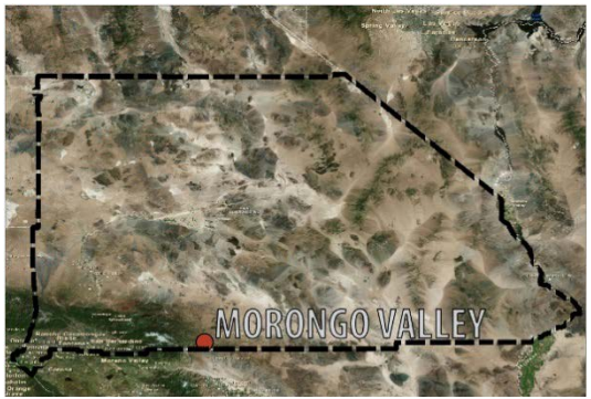
Figure 1: Morongo Valley Location