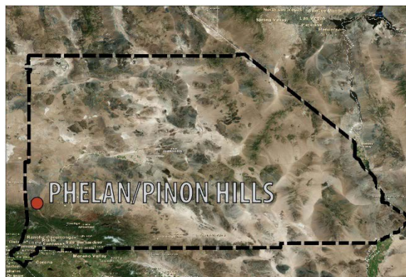
Figure 1: Area Map